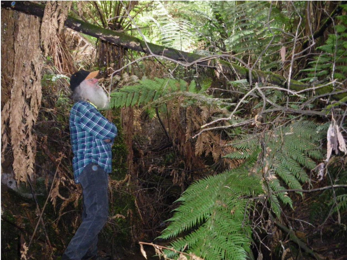
Figure 2. A typical scene within the gully, using a flash to compensate for low sunlight.

The vegetation along the creek immediately west of Prices Rd, in the reserve's southeastern corner, does not fit any recognised EVC very well but is closest to Cool Temperate Rainforest. It is similar to the gully described in my 2009 report as a variant of Cool Temperate Rainforest, which is listed by the Department of Sustainability & Environment as 'Endangered' (the highest level of threat).