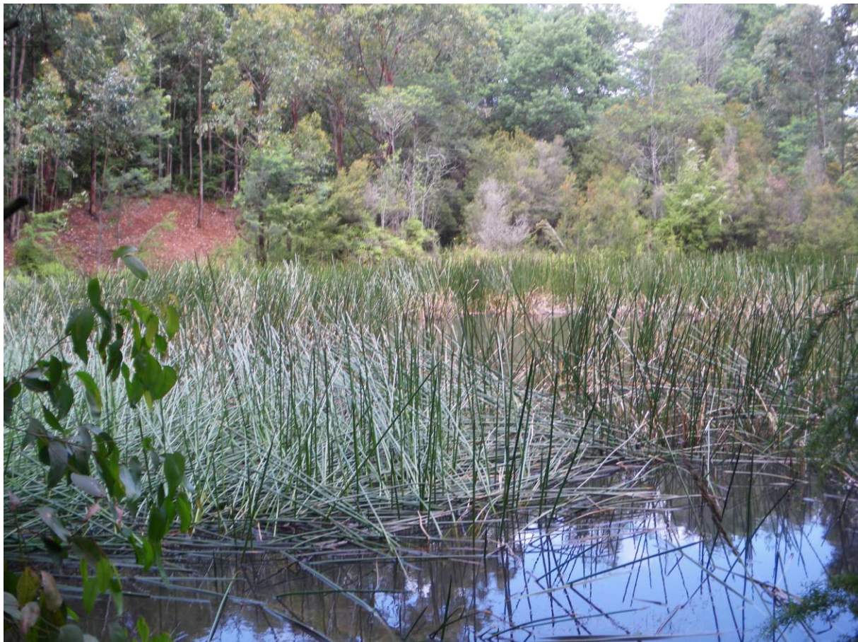
Figure 3. An eastward view across the dam, with Riparian Thicket on the far right.

The southwest corner of the Hoddles Creek Education Area was found to have been cleared and a farm dam constructed on a gully in recent decades. This was unexpected, given that the reserve has been public land for many decades.