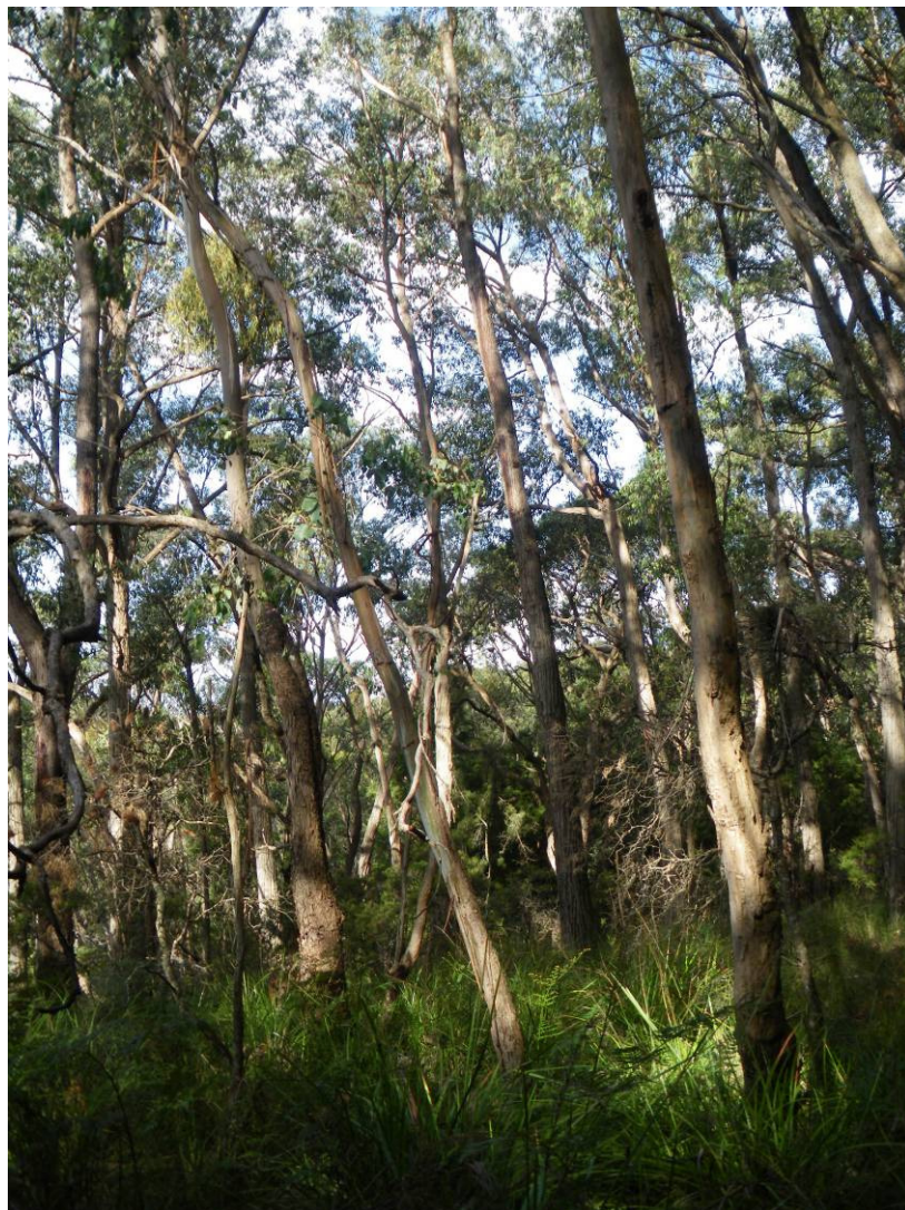
Figure 4. A view of Swampy Woodland, with Swamp Gums over Tall Sword-sedge.

The occurrences mapped in the west of the Hoddles Creek Education Area fall under the category of 'suitable substrates ... of sedimentary origin'. They are atypical in having few creeping herbs and specialist species of swampy ground, but Swampy Woodland is presently the best fit within the EVC classification system.